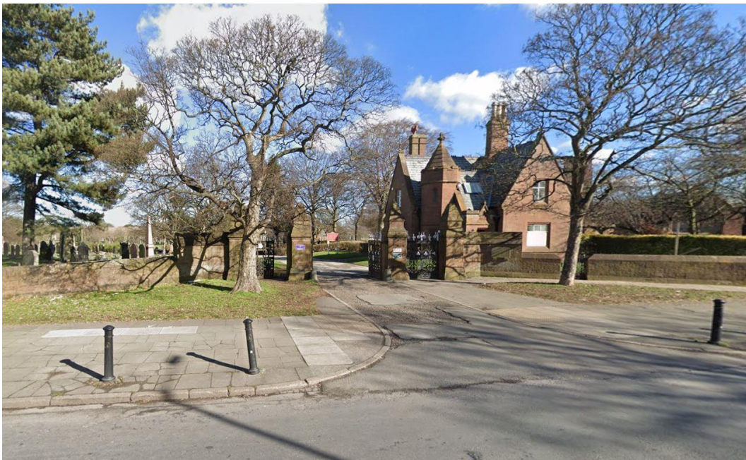
Anfield Cemetery, Liverpool